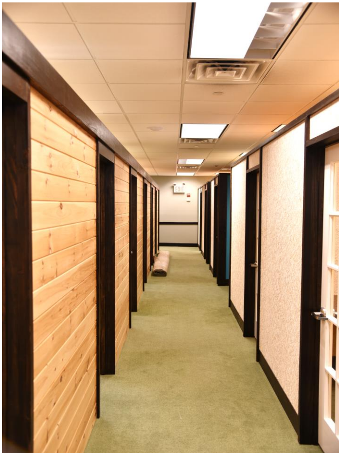
Downstairs Office Space