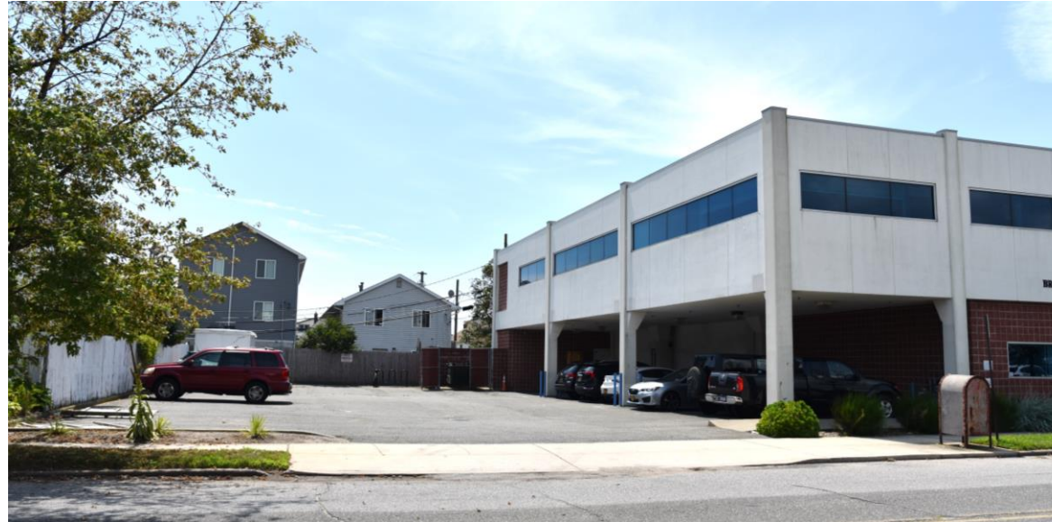
Rear Parking Lot