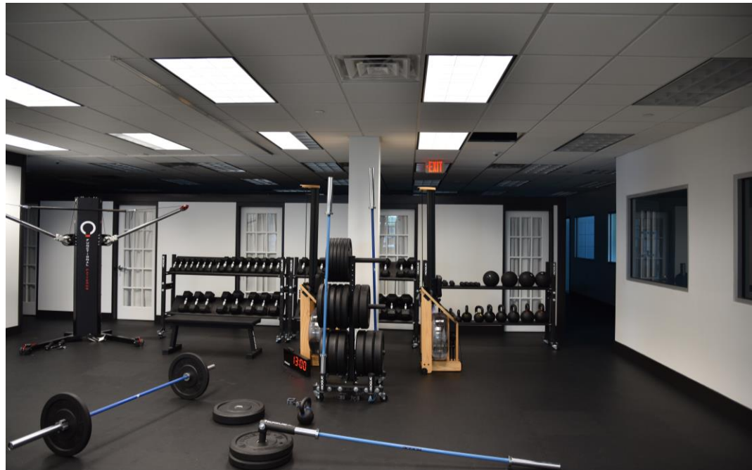
First Floor Space