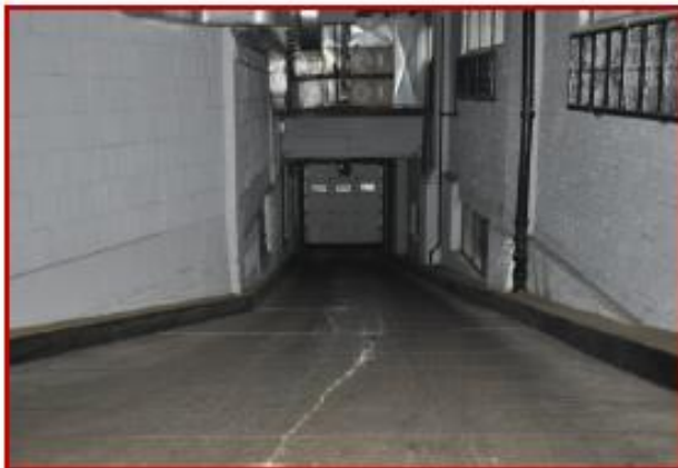
Drive in Ramp from 1 st to 2 nd Floor