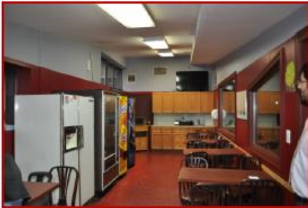
2 nd Floor Kitchen