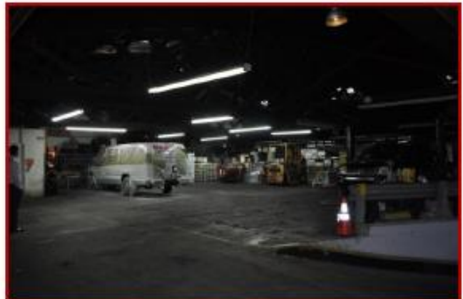
3 rd Floor Warehouse Space