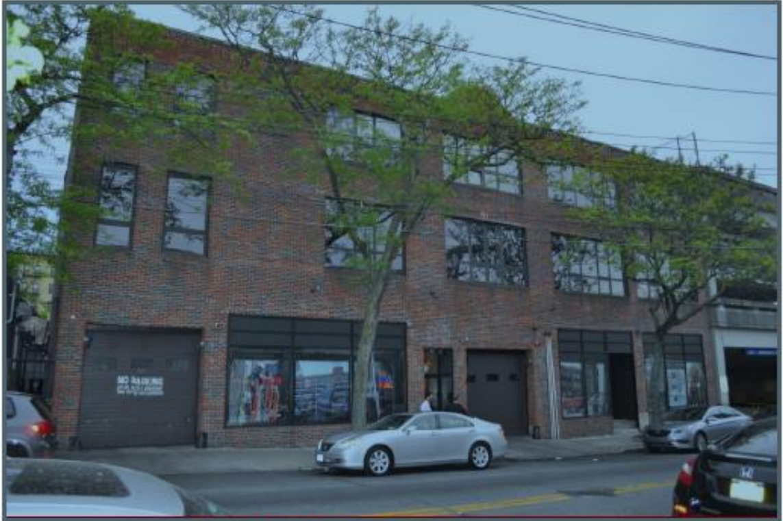
Street View from West Broad