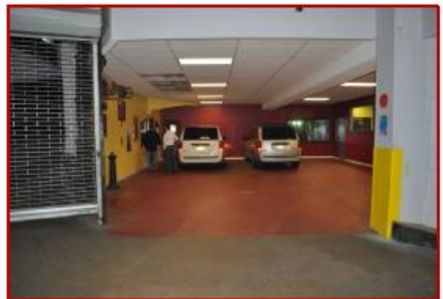
2 nd Floor Indoor Parking Adjacent to Office Space