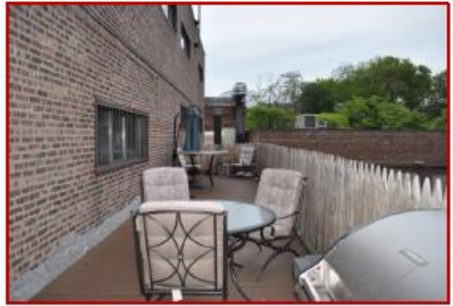
2 nd Floor Outdoor Deck