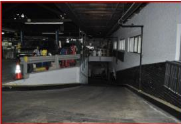
Drive in Ramp from 2 nd to 3 rd Floor