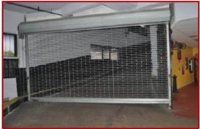
2 nd to 3 rd Floor Ramp With Gate