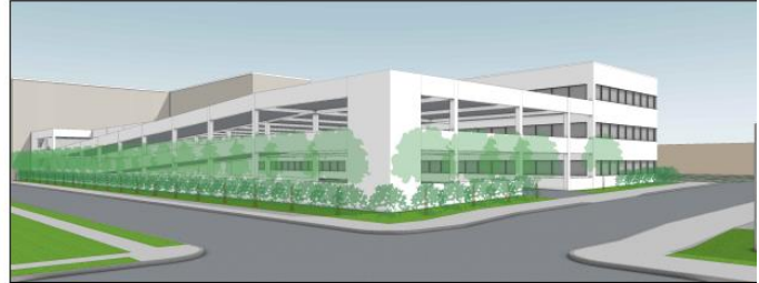
STREET VIEW - SOUTH EAST OF BUILDING