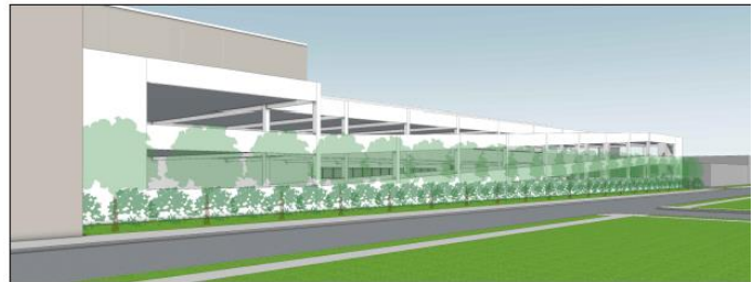
STREET VIEW - SOUTH WEST OF BUILDING