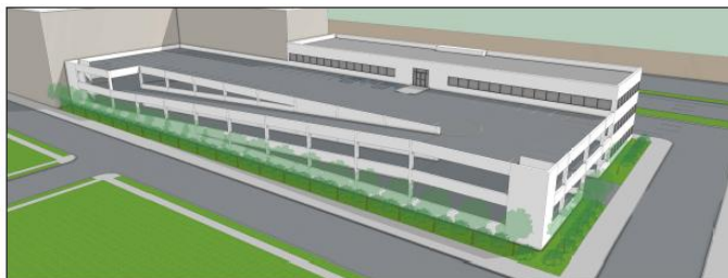
AERIAL VIEW - SOUTH EAST OF BUILDING