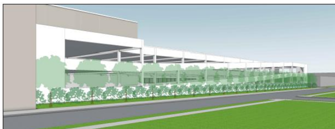
STREET VIEW - SOUTH WEST OF BUILDING