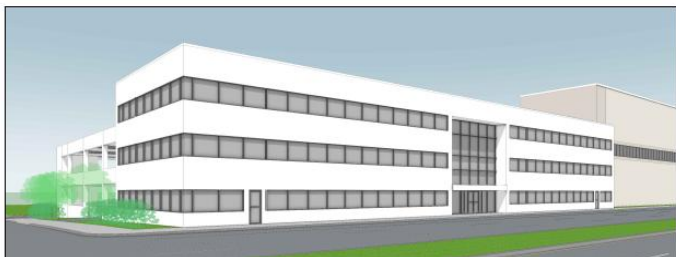
STREET VIEW - NORTH EAST OF BUILDING