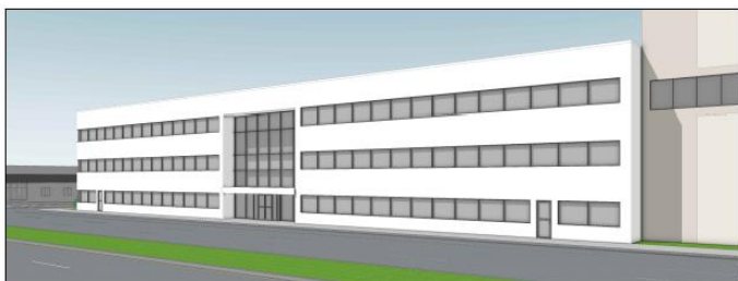
STREET VIEW - NORTH WEST OF BUILDING