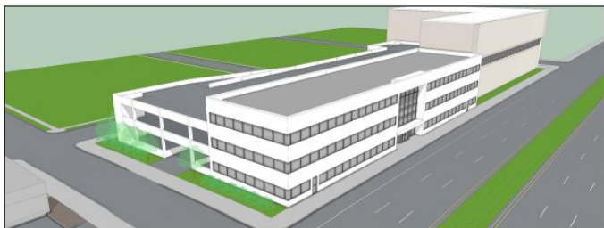
AERIAL VIEW - NORTH EAST OF BUILDING