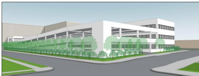
STREET VIEW - SOUTH EAST OF BUILDING